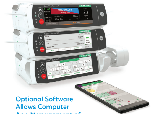
Optional Software Allows Computer App Management of Pumps and Doses