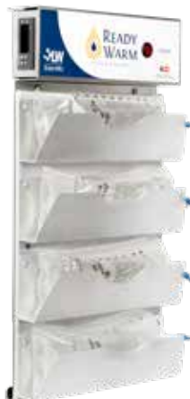
J0900SK: Wall-Mount Shelf Kit ONLY

Convert the table model into a wall-mounted model by adding the optional Wall-Mount Shelf Kit