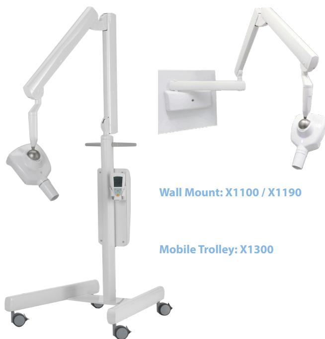
Wall Mount: X1100 / X1190

A touch-sensitive on/off lock enables effortless repositioning of the tube head between exposures.